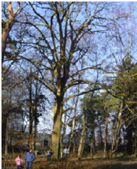
The beautiful woods that are under threat, and (above right) the stone curlew